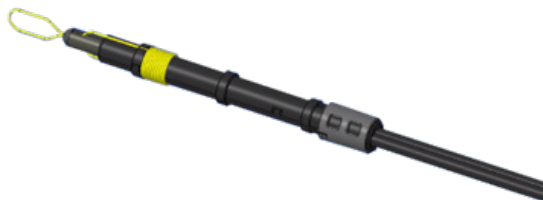
Pulling Bullet FLATdrop 900um Peelable

Scan for FieldShield Small Form Factor Video.