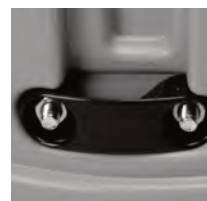
Self-locating Cover Security Lock Receiver