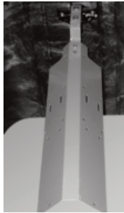
Swing-arm with Butterfly Mounting Plate