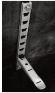
Step Rack (included with each vault)