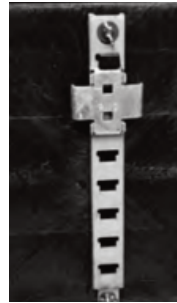
Step Rack with Universal Mounting Bracket (Must be ordered if mounting SCD Case in vault)