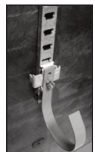
Cable Hook Bracket