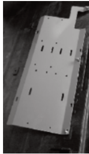
Sidewall Mounting Plate