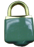
Brass Pad Lock