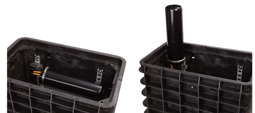
Below-Grade (Vault) SCD Case inside grade level vault – up and down position. Order VA-STUB universal mounting bracket.