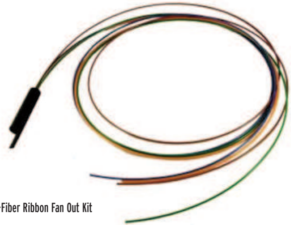
144-Fiber Ribbon Fan Out Kit

When ribbon fiber in excess of 144 is required, the Ribbon Break Out Box is used in conjunction with the Ribbon Fan Out Kit for up to 864 fibers.