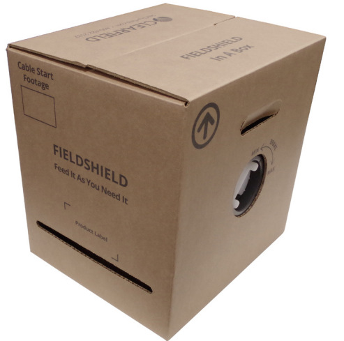
Available in 1, 2, 6, 12, 24 and 48 fiber counts