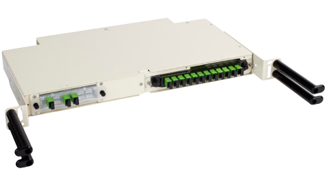
Rack Mount SCD Panel with xPAK and Clearview Blue Cassette

The FieldSmart SCD Panel provides the ability to rack-mount Clearview devices in a single rack unit. The 2 slot panel version supports the 12 port Clearview Cassette or the two port, four port or six port Clearview xPAK in a single rack unit. The 3 slot panel version supports up to 3 Clearview xPAKs in a single rack unit. The product is available as either a 19" or 23" (482.60 mm or 584.20 mm) rack-mount unit. The FieldSmart SCD 1RU is intelligently designed to provide the user with superior fiber access while using craft-friendly radius protected fiber management for routing and deploying fiber jumpers.