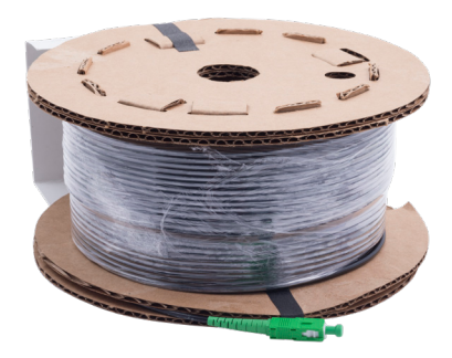
Lengths from 75' to 200' (22.86 m to 61 m)