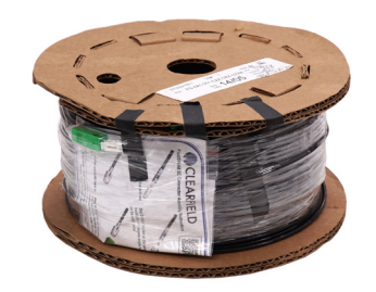
Lengths from 32' to 350' (9.75 m to 106.68 m)