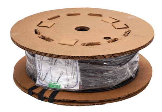
Lengths greater than 350' (106.68 m)