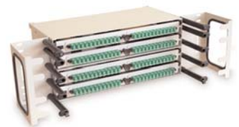
F19 VHD 192-port