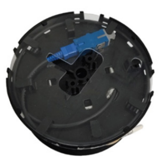
FLEXdrop Deploy Reel